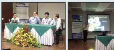
Industrial panel session.