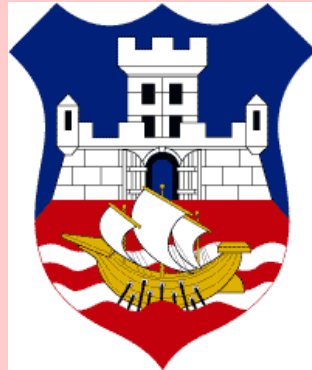
Belgrade Coat of arms