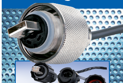
RJ 45 Cat.5e plug and receptacle housing kit, bayonet coupling, black plastic version, Partno. 17-10000 (receptacle) 17-10001 (plug)