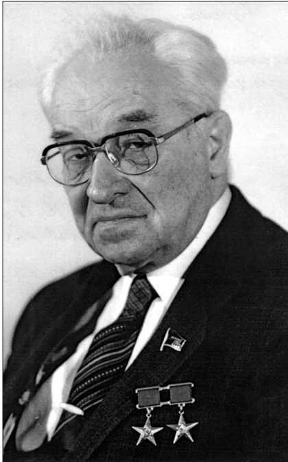
Figure 3. Kotelnikov in later years

army seemed likely to reach Moscow, Kotelnikov's laboratory, together with other scientific establishments, was evacuated to Ufa, around 1000 km to the east. There the laboratory continued to work on secure radio telephony, and by the beginning of 1943 such equipment was being produced on a large scale for the Red Army, having been tested the year before during the battle of Stalingrad. The encryption equipment was later used during negotiations at the Tehran, Yalta, and Potsdam Conferences.